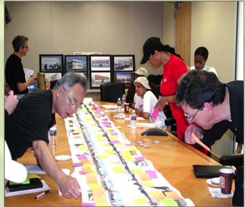
Bandini Canyon Walkthrough West Adams Steering Committee