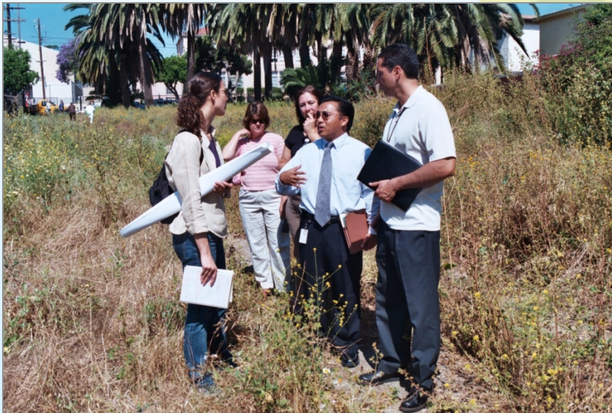
Bandini Canyon Walkthrough